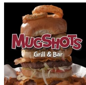
Right: Mugshots Logo

The University of Alabama Attn: Crimson Racing - Formula SAE 245 7th Ave. 359 H.M. Comer Tuscaloosa, AL 35487 Email: alabamafsae@gmail.com